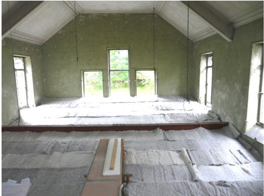
Figure 2: Upper level of the main meeting room (Brian Sawley, 2009)