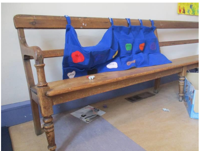
Figure 3: Open-backed pine bench

Throughout the meeting house, there are open-backed pine benches with turned front legs, dating from the nineteenth century.